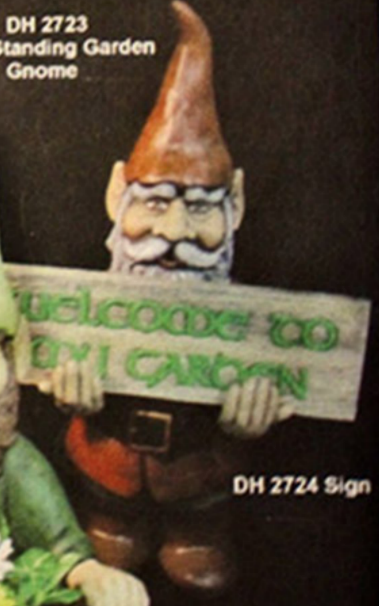
DH 2724 Sign