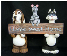
2702 Dog / 2718 Mouse / 2704 Cat / 2717 Sign