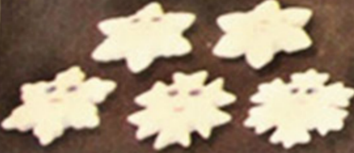
DH 2727 Small Snowflakes