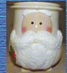
2841 Plain Dip Chiller 2839 Chiller Insert