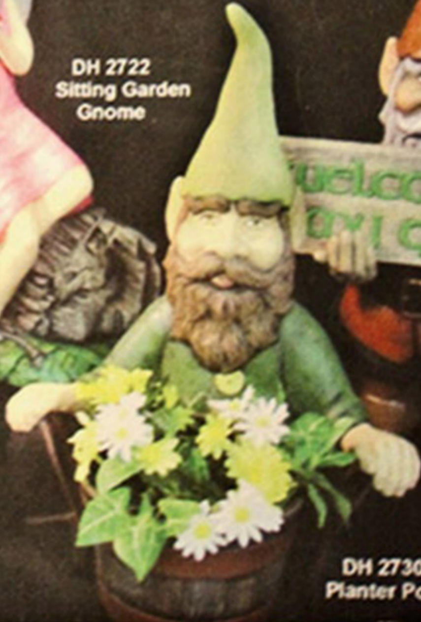
DH 2730 Planter Pot