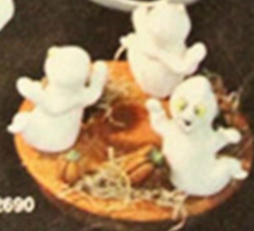
DH 2690 Ghosts