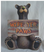
2662 Sitting Bear 14" 2663 Sign