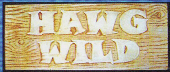
2779 Welcome Pig