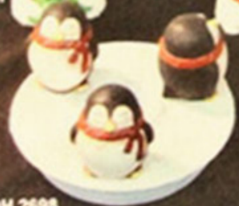
DH 2698 Penguins