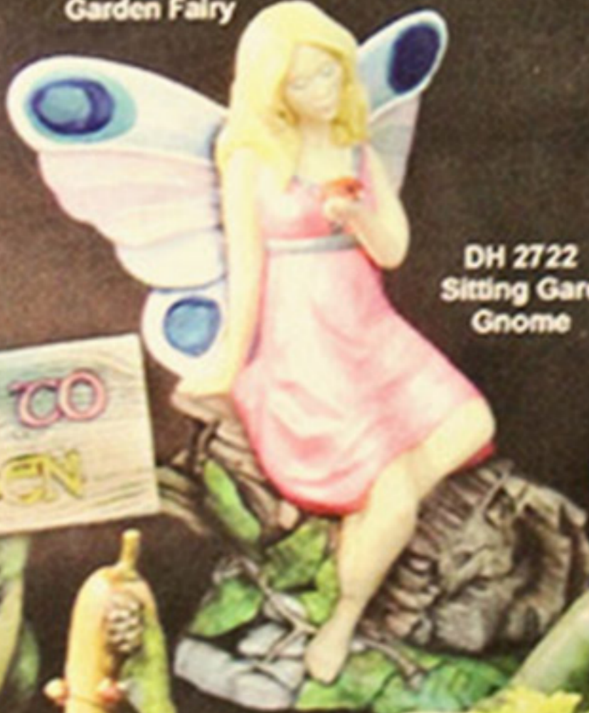
DH 2722 Sitting Garden Gnome