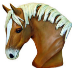
2787 Draft Horse Bust 8x8