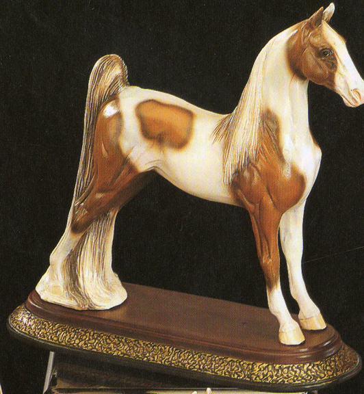
PK 102 Saddlebred Horse 11" L