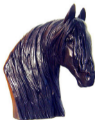
2785 Friesian Horse Bust