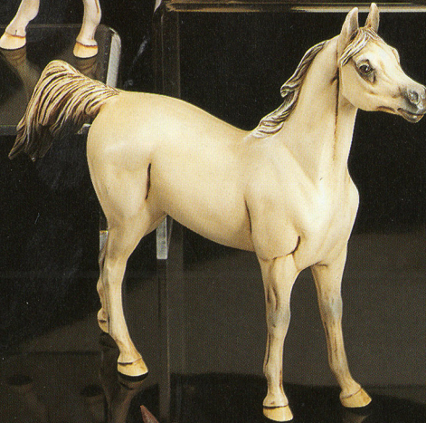
DH 1455 Arabian Horse 11"