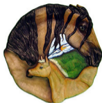
2795 Mare and Foal Plate 10x10