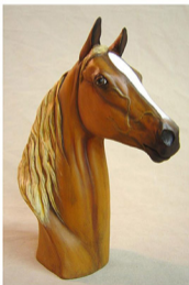
2868 Morgan 8x8