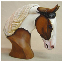
2869 Tennessee Walking Horse 7x7