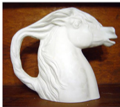
2863 Horse Pitcher 9.5x11