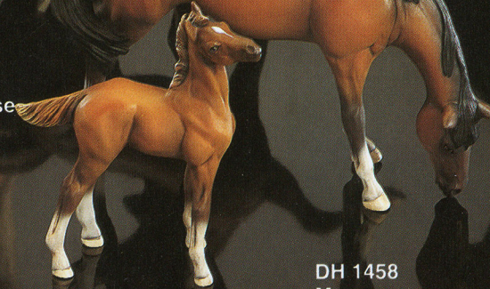
DH 1458 Mare 9" L