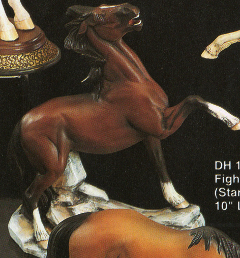
DH 1461 Fighting Stallion (Standing) 10" L