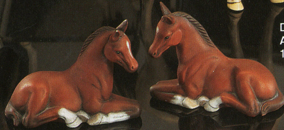
DH 616 Small Foals (2 in mold) 6"