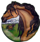
2796 Horse Country 10x10