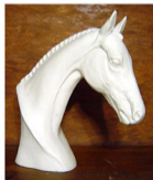
2867 Hunter Jumper 8.5x7.5