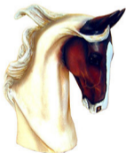
2784 Saddlebred Horse Bust