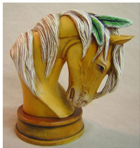
2865 Indian Pony 6.5x7