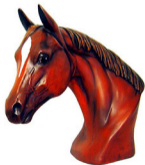
2783 Quarter Horse Bust 8x8