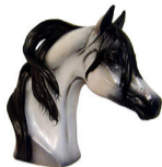
2782 Arabian Horse Bust 8x8