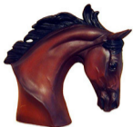
2786 Thoroughbred Horse Bust 8x8