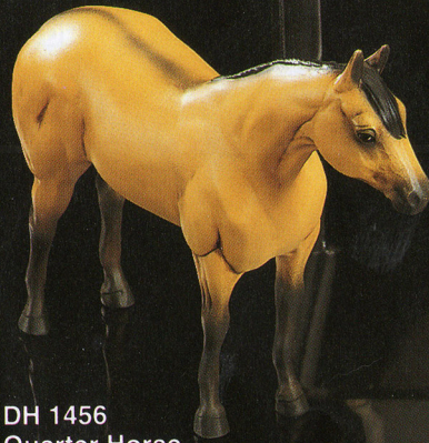
DH 1456 Quarter Horse 10" L